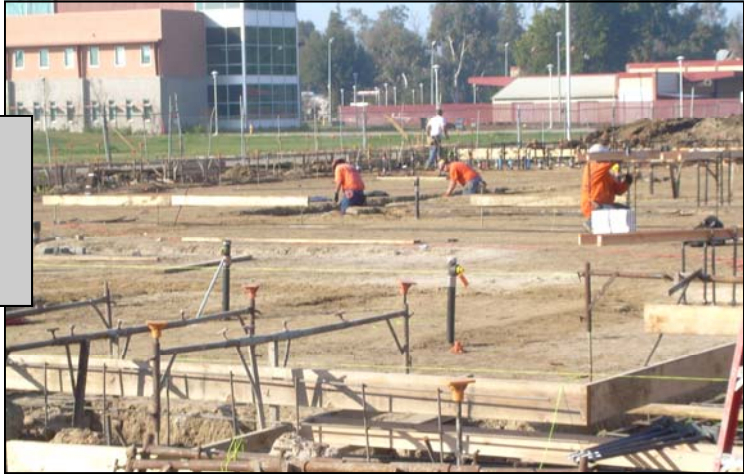
Forms at the East Building Footings