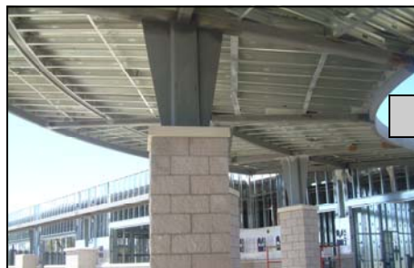
Breezeway & West Building